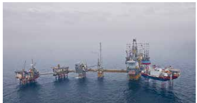
Eldfisk 2/7-S (ConocoPhillips): 2 DH Bellows, 2 IH Bellows, 2DH Weather Bellows