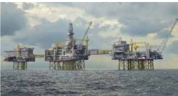
Johan Sverdrup, Phase 1 (Statoil): 2 DH Bellows, 2 IH Bellows, 2 DH Weather Bellows