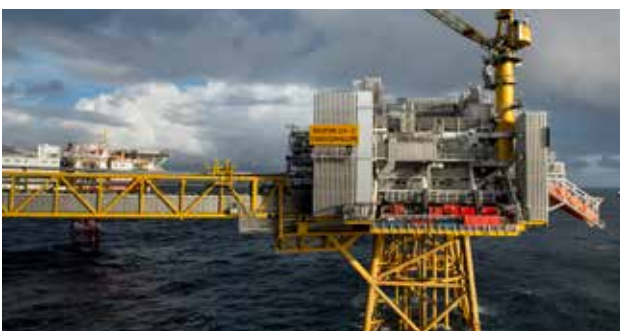
Ekofisk 2/4-Z & 2/4-M (ConocoPhillips): 5 DH Bellows, 4 IH Bellows (incl. spares)