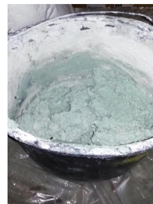
Mix GPG Marine to desired consistency

Firesafe Energy AS, Robsrudskogen 15 / PB 6411 Etterstad / NO-0605 Oslo / Norway Telephone: +47-09110 www.firesafe.no www.firesafeoffshore.no